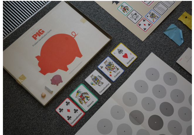
Box and some contents of the 'Problem Identification Game (PIG)', an experimental board game developed for the second level Design course, T262 Man-made Futures: Design and Technology.

Television and radio programs were the most public-facing elements of its program, but on their own they could not live up to the responsibility of education. The fulfillment of its promise of homebound learning required a careful choreography between timed broadcasts, printed supplements, mail-order technical equipment, and assessments and tutorials by mail and over the phone. Dematerialized learning required careful encapsulation for the educational program to move safely through a dense domestic landscape of media and into the minds of its students. The traditional course syllabus was replaced by a broadcast schedule; bibliographies were compiled into print anthologies; laboratory experiments were repackaged and distributed as DIY kits; broad debates were synthesized as specific examples; and lectures were transformed into small documentaries. Television also imposed its own limits on the amount of times each program, or each course, could be aired and run.