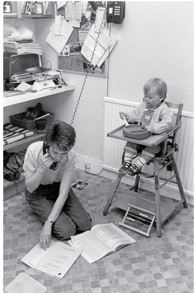
Telephone tutorials enabled those who could not attend face-to-face tutorials to receive support.

offshore platforms, and incarcerated people, among others.